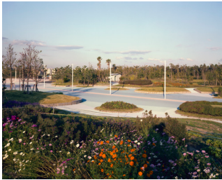
Takashi Homma Tokyo