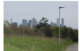
Federico Gioco Mile End