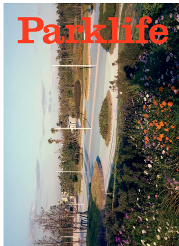
Front Cover Takashi Homma, Tokyo

www.parklife-parklife.com @parklifeparklife